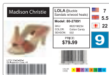
Product Identification Using Pictures