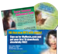
Customized Promotional Messages