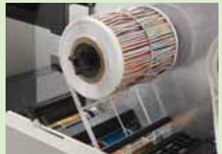
Waste matrix removal