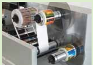
Rewinding to finished rolls

www.labelpower.com.au | sales@labelpower.com.au